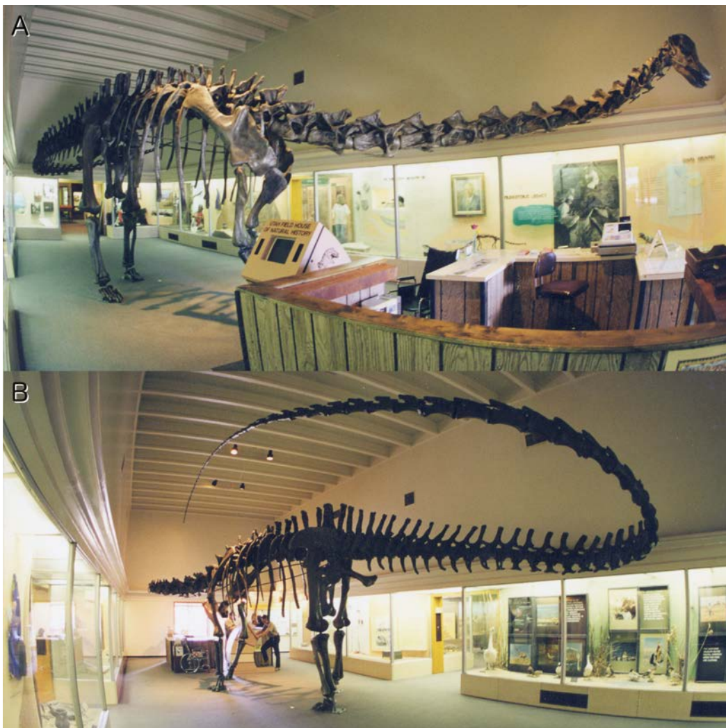
Figure 8. The second-generation lightweight Diplodocus cast as originally displayed at the old Field House building between 1994 and 2004. (A) Right anterolateral view, showing the head and neck projecting above the admission counter. (B) Left posterolateral view, emphasizing the curvature of the elevated tail necessary to fit the 76-foot-long skeleton into the 50-foot-long exhibit hall.

In subsequent years, further casts were made from the Dinolab molds. Table 1 summarizes information from Madsen’s (1993) report to the Carnegie Museum and the Field House, together with additional in-