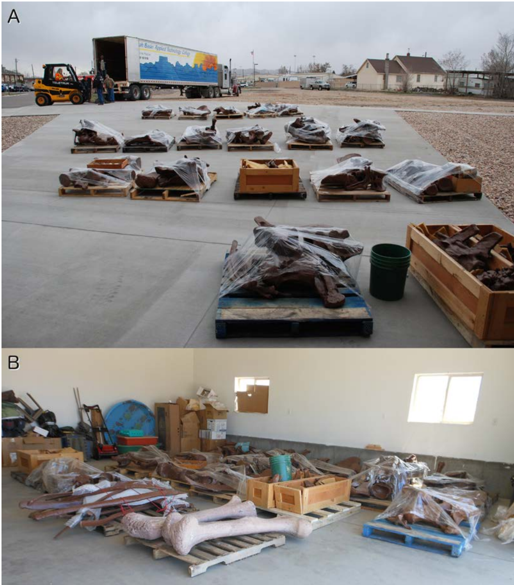
Figure 11. The elements of the concrete cast moving from Vernal to Price, Utah, on April 8, 2013. (A) The concrete cast packed onto wooden pallets outside the new Field House building, having been prepared for transportation to the Utah State University Eastern campus in Price, about 100 miles southwest of Vernal. (B) The same bones having been unpacked into Ken Carpenter's garage in Price, Utah.

cause that is where the city holds outdoor events, and no room on the north side because of the parking lot and overhead main power line for downtown businesses. The intention was that the cast would be mounted outside a new museum in Price, which was then in the planning and fund-raising stage. However, due to funding difficulties this museum was never built and the land that had been donated for the museum was returned to the donor. In light of these developments, Carpenter discussed with the USU chancellor the possibility of temporarily mounting the skeleton on campus. However, this idea was not implemented since Carpenter feared that mounting and later dismantling the cast to move it to a new museum would damage it. Therefore,