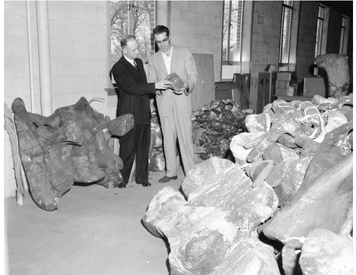
Figure 2. The original Diplodocus molds created by the Carnegie Museum, shown in the Utah Field House some time between 1953 and 1955. In the background to the left is the mold for the sacrum and coalesced ilia, seen in right ventrolateral view with anterior to the top. The molds closely follow the shapes of the bones they were modelled from, but are noticeably bulkier.