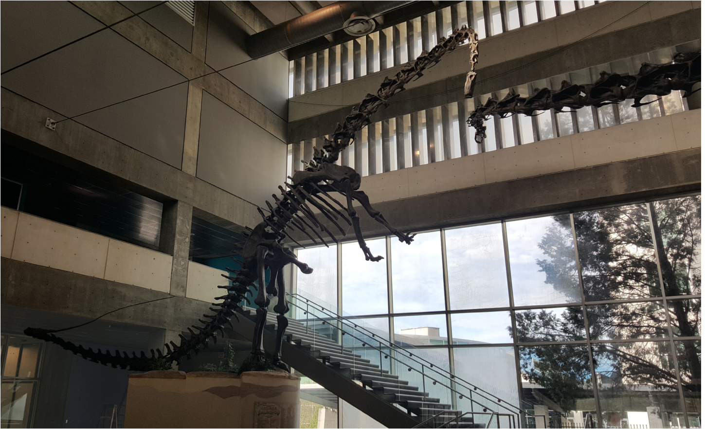
Figure 10. Double Diplodocus mount at the Museum of Science and Industry (MOSI), Tampa, Florida. Both individuals are identical, having been cast from the molds made by Dinolab from the concrete Diplodocus of Vernal.

gested posting a news article requesting the return of the bones, and the workman came forward with them enabling the femora to be reunited with the rest of the concrete skeleton.