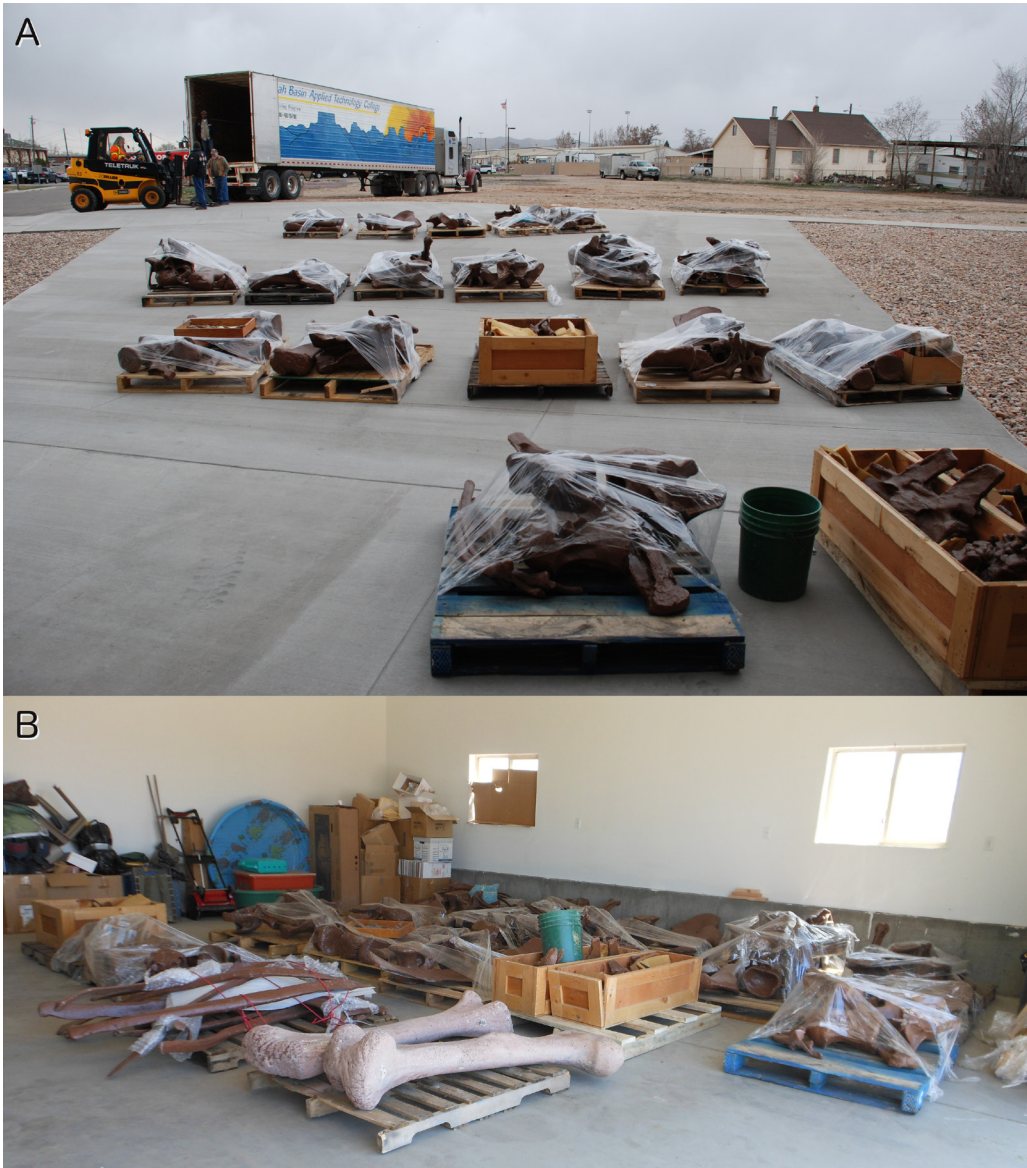
Figure 11. The elements of the concrete cast moving from Vernal to Price, Utah, on April 8, 2013. (A) The concrete cast packed onto wooden pallets outside the new Field House building, having been prepared for transportation to the Utah State University Eastern campus in Price, about 100 miles southwest of Vernal. (B) The same bones having been unpacked into Ken Carpenter's garage in Price, Utah.

cause that is where the city holds outdoor events, and no room on the north side because of the parking lot and overhead main power line for downtown businesses. The intention was that the cast would be mounted outside a new museum in Price, which was then in the planning and fund-raising stage. However, due to funding difficulties this museum was never built and the land that had been donated for the museum was returned to the donor. In light of these developments, Carpenter discussed with the USU chancellor the possibility of temporarily mounting the skeleton on campus. However, this idea was not implemented since Carpenter feared that mounting and later dismantling the cast to move it to a new museum would damage it. Therefore,