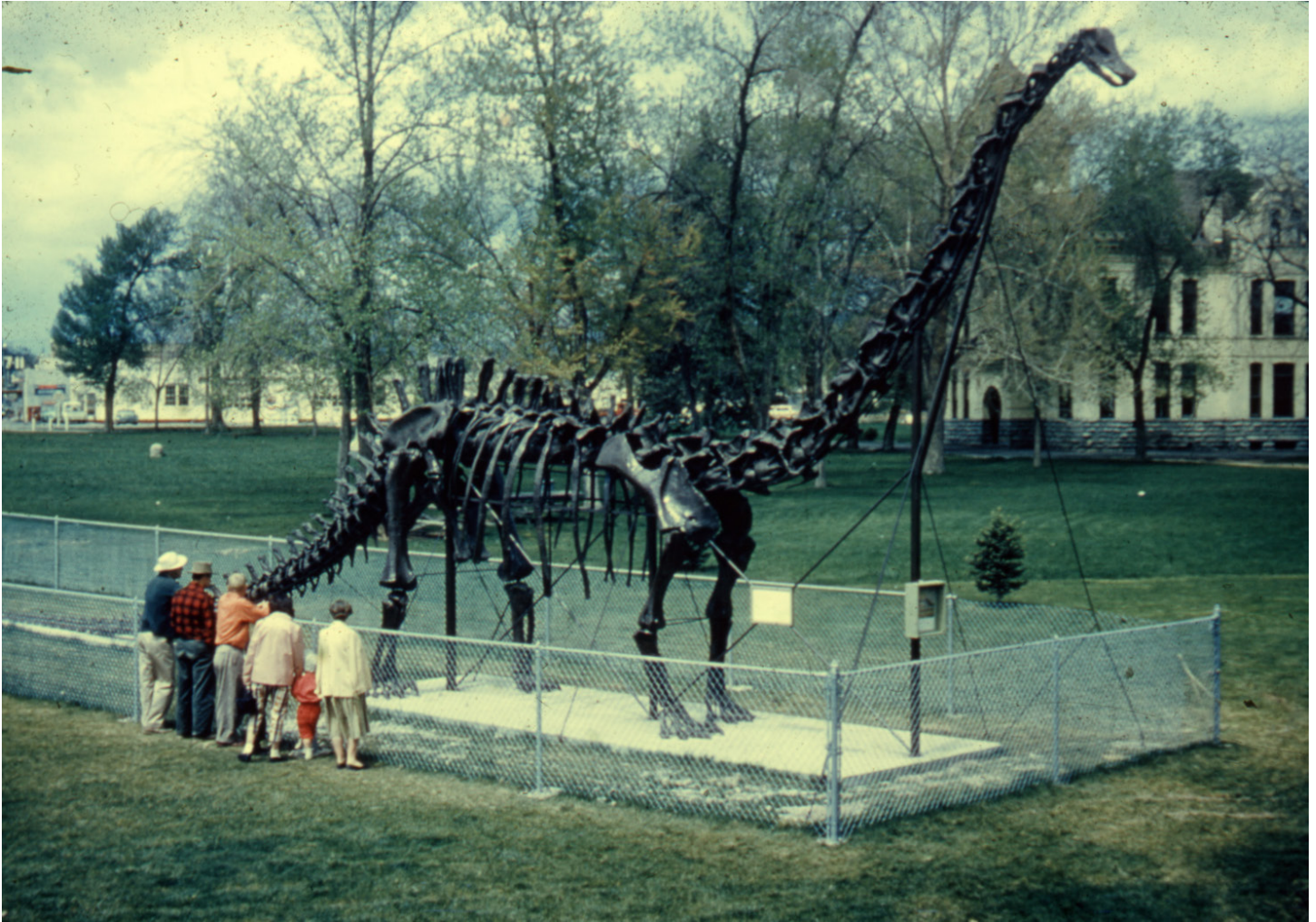
Figure 5. The completed outdoor Diplodocus mount in a rare color photograph (undated).

ed that casting “will start soon” (Anonymous, 1960d), but evidently that work was significantly delayed as nearly a year later on June 11, 1961, the museum reported that “work will begin here Monday on a replica of a pre-historic dinosaur that will eventually tower 21 feet in Sunset Park [...] the project will consume many months before the animal will be erected on a frame in the park” (Anonymous, 1961a). Already by this point the disorganization and physical state of molds was of concern as “Several months will be involved classifying and preparing molds for casting” (Anonymous, 1961a).