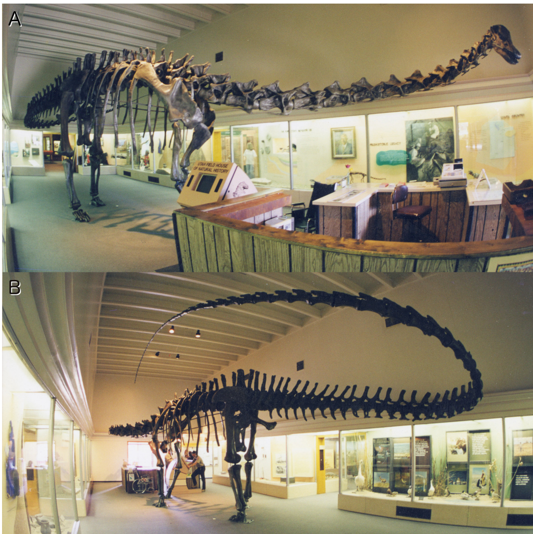
Figure 8. The second-generation lightweight Diplodocus cast as originally displayed at the old Field House building between 1994 and 2004. (A) Right anterolateral view, showing the head and neck projecting above the admission counter. (B) Left posterolateral view, emphasizing the curvature of the elevated tail necessary to fit the 76-foot-long skeleton into the 50-foot-long exhibit hall.

In subsequent years, further casts were made from the Dinolab molds. Table 1 summarizes information from Madsen’s (1993) report to the Carnegie Museum and the Field House, together with additional in-