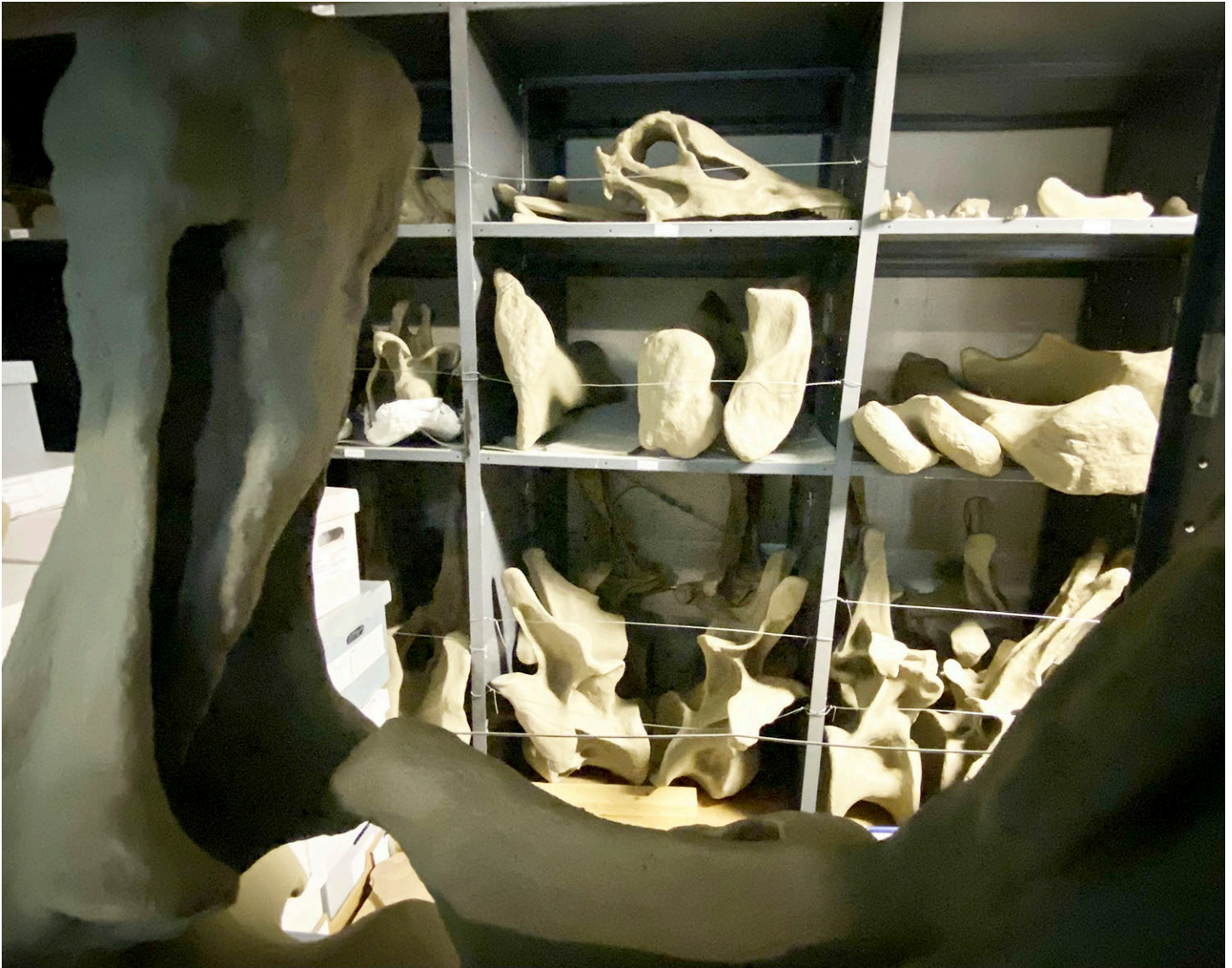
Figure 13. The elements of the concrete cast as they are now, having been cleaned and stored in the basement storage area on the Utah State University Eastern campus in Price, Utah.

Even the Diplodocus that started it all, the cast presented by Andrew Carnegie to the British Museum (Natural History) on May 12, 1905, seems to be ambling towards an undistinguished fate. Having been the centerpiece of the museum’s main hall for nearly four decades, it was removed in 2017 to make more space for corporate events (Steerpike, 2015; Nieuwland, 2019, p. 260). The cast was sent on a tour of the UK, but now that this has concluded, “in all likelihood the plaster dinosaur will meet an inglorious end in the basement of the museum” (Nieuwland, 2019, p. 4). However, while