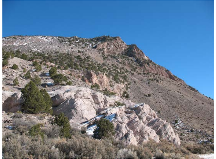
Figure 4. View northeast at the volcanic dome of Phonolite Hill from the geosite parking lot. The white, left- (north-) dipping beds in the foreground are the inner part of a tuffaceous crater that surrounds the dome. Light-tan rocks just above the white, snow-covered rocks are the vertical plug (vent) of rhyolite dome rock that intrudes the crater. This rock includes a black-glass chilled margin at the intrusive contact, from where the sample was collected for K-Ar dating. Rhyolite dome rock, with generally vertical cooling joints, makes up most of the mountain.