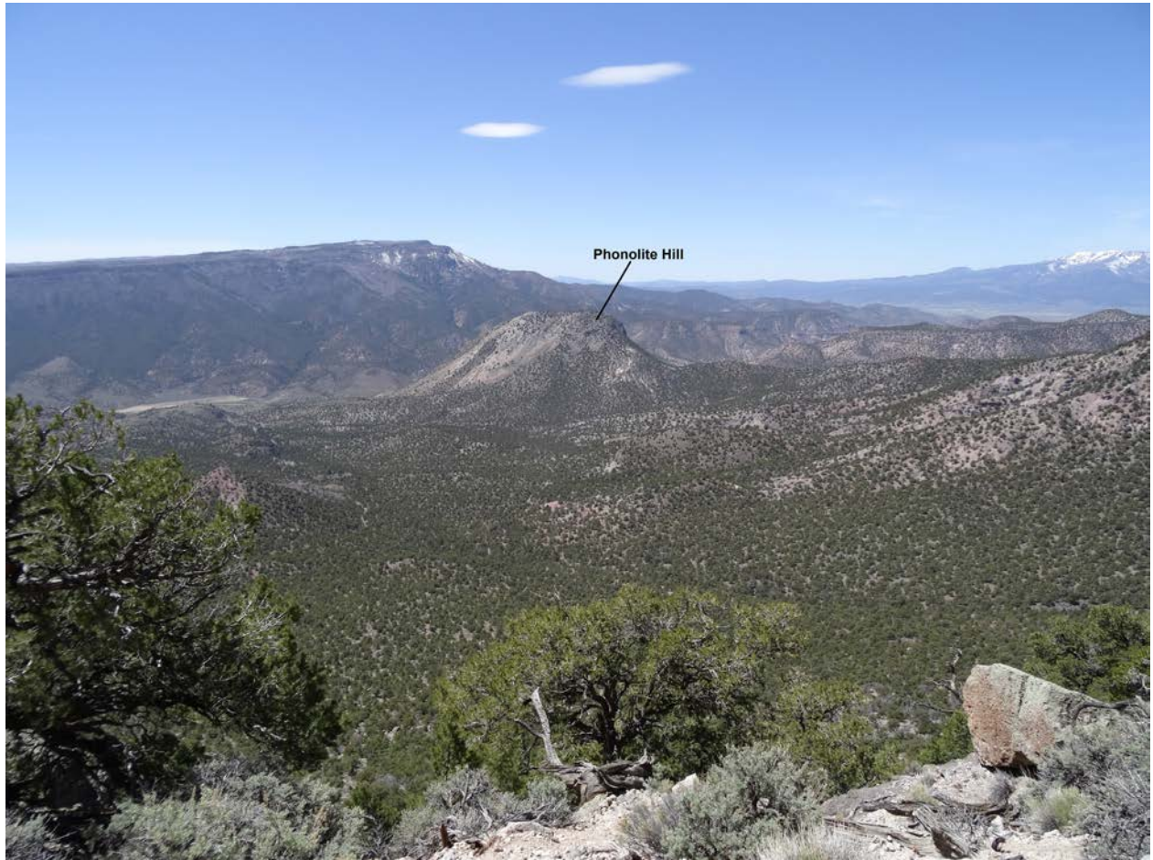
Figure 5. View south from Forshea Mountain showing Phonolite Hill. Phonolite Hill, a rhyolite dome, erupted 5 million years ago at the bottom of Kingston Canyon. The photographer is standing on the 8 Ma rhyolite of Forshea Mountain. The top of the gently east-dipping canyon wall across the canyon would have been a valley floor 8 million years ago. The Sevier fault is to the right of the hills at the far right of the view, west of which is a glimpse of Sevier Valley. The base of the 5 Ma rhyolite dome of Phonolite Hill is at the current canyon floor, showing here a minimum of 4000 feet (1200 m) of uplift (it would show as more if the south wall were projected out to the Sevier fault) on the Sevier fault between 8 and 5 Ma.

Forshea Mountain. The rhyolite of Forshea Mountain was interpreted to have been deposited horizontally, like the beds below it, and only later was the Sevier Plateau uplifted along the Sevier fault zone and tilted east. Figure 5 shows the view from Forshea Mountain; figure 6 gives a glimpse of the northern wall, along with Phonolite Hill itself.