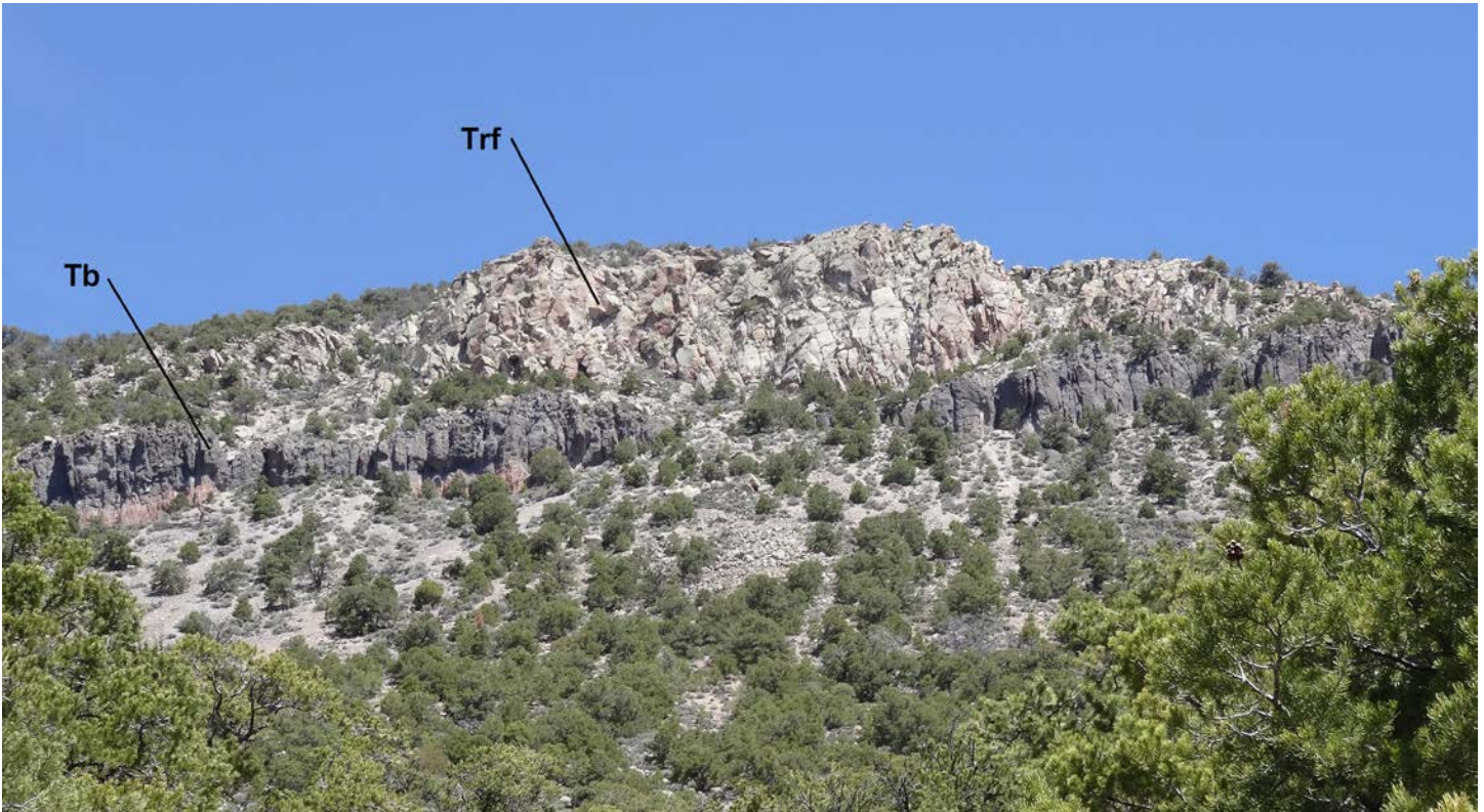
Figure 3. View north to the southern side of Forshea Mountain, showing a thin basalt ledge (Tb) overlain by a cliff of the rhyolite of Forshea Mountain (Trf).

Rowley and others' (1981) conclusion on the age of basin-range deformation of the Sevier Plateau, however, seems to have been ignored, perhaps because other geologists doubted that such a rapid history of faulting, uplift, and canyon cutting was possible, or perhaps they doubted the isotopic ages. Much later, Bob Biek of the Utah Geological Survey (UGS), Dave Hacker of Kent State University, other colleagues, and I (Pete Rowley) were again remapping much the same area, namely the Panguitch (Biek and others, 2015a), Loa (Biek and others, 2015b), and Beaver 30' x 60' quadrangles (Rowley and others, 2005), to determine the extent of the Markagunt and Sevier gravity slides. Because the ages of the two rhyolite masses were critical in determining the geomorphology and basin-range history of the area, and now a modern and more accurate method of dating ( ^{40}\text{Ar}/^{39}\text{Ar} ) had been developed, the UGS ran samples from the two rhyolites again. The numbers are close, 4.7 \pm 0.4 Ma on sanidine/plagioclase phenocrysts from the rhyolite of Phonolite Hill, and 7.89 \pm 0.12 Ma on sani-