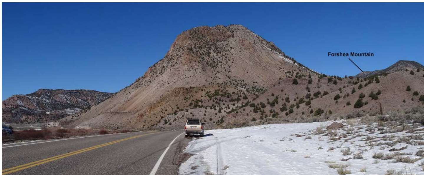
Figure 6. View west-northwest at Phonolite Hill. The top of Forshea Mountain in the northern wall of Kingston Canyon is capped by the 8-million-year-old rhyolite of Forshea Mountain, barely visible as the farthest hill on the right. The mesa at the left skyline consists of the 27-million-year-old Three Creeks Tuff Member of the Bullion Canyon Volcanics.